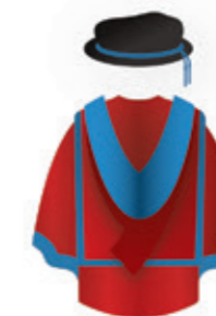
Doctor of Philosophy