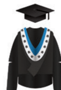
Master of Science