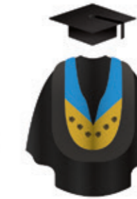
Bachelor of Business Administration