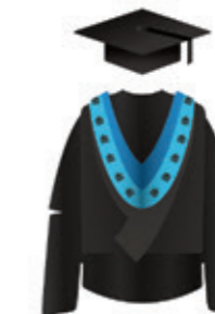
Master of Research