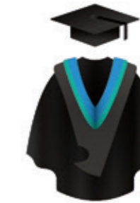
Postgraduate Certificate in Education