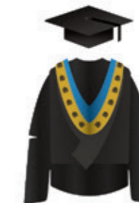
Master of Business Administration