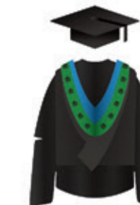
Master of Laws