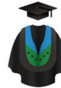
Bachelor of Laws