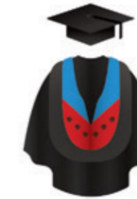
Bachelor of Arts