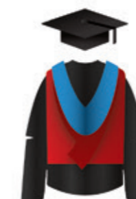
Master of Philosophy